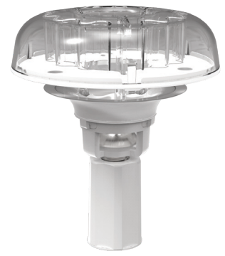
Time to Change

Read these instructions completely and carefully